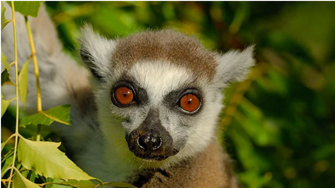
Ring-tailed Lemur in the Berenty Reserve

Berenty is a private nature reserve that was created in the early 20th century to protect the rare wildlife of the special spiny forest, only found in southern Madagascar. The reserve is home all sorts of different animals, from rare endemic birds like couas, vangas and owls, to chameleons, tortoises and strange insects such as the enormous giant cockroach and beautiful jewel beetles ( you can see some of them in my trip report here ).