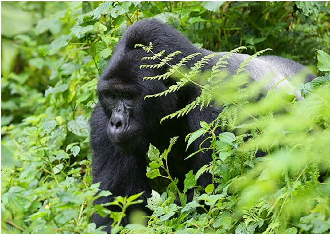
Silverback Mountain Gorilla in Bwindi Impenetrable Forest