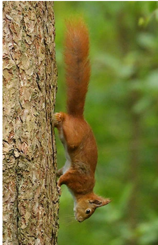
Red Squirrel on the Isle of Anglesey